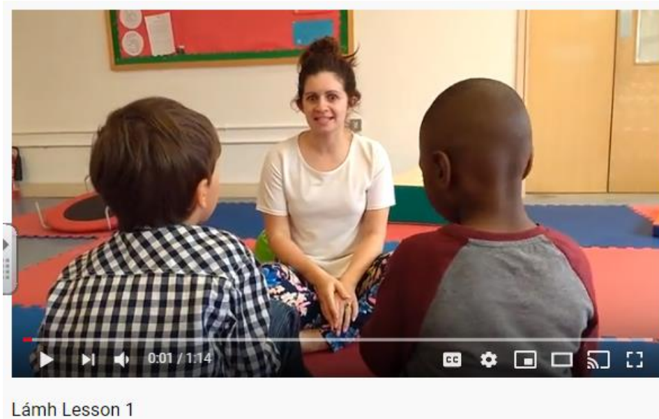
Lámh Lesson 1

https://www.youtube.com/watch?v=iHvHhSvv5KA