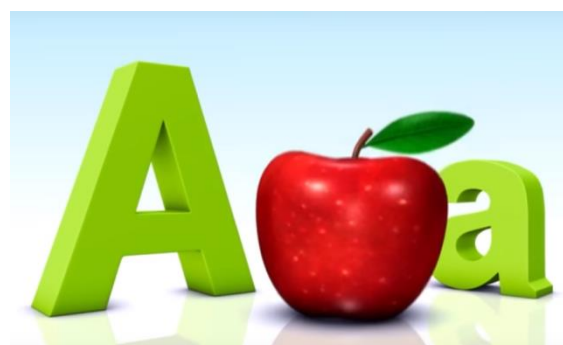
Phonics – 53 mins 27 seconds