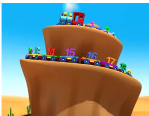
Numbers – 37 mins 22 seconds