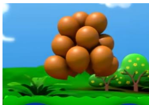
Colours – 25 mins 52 seconds