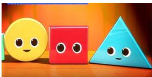
Shapes – 2 mins 42 seconds

https://www.youtube.com/watch?v=fMMJ5IibHLw