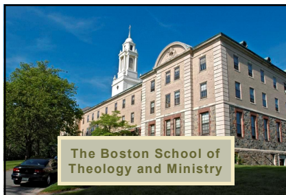
The Boston School of Theology and Ministry

There are men and women who claim they understand ancient Hebrew and Greek, yet offer countless interpretations . But God has already spoken to us by His Son +(HEBREWS 1:1-2), and His Word IS NOT of any PRIVATE INTERPRETATION +(2 PETER 1:20). God said, as NEWBORN