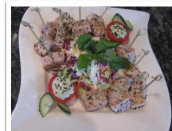
Grilled Ahi Bites with Wasabi Crème