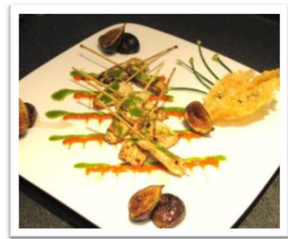
Teriyaki Chicken Skewers