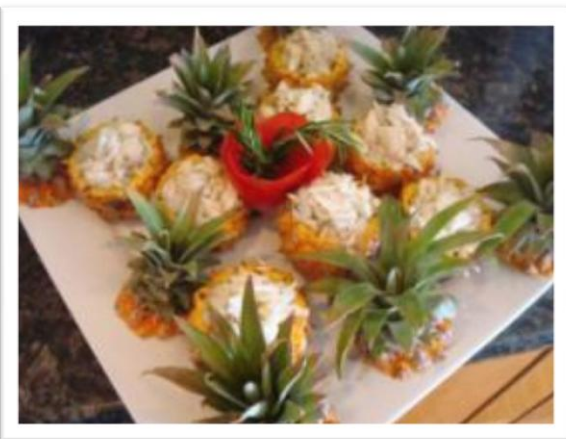
Crab Salad Stuffed Pineapples