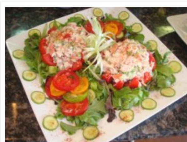
Shrimp Salad Stuffed Tomatoes