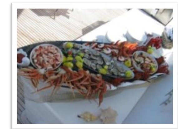
Fresh Seafood Platter