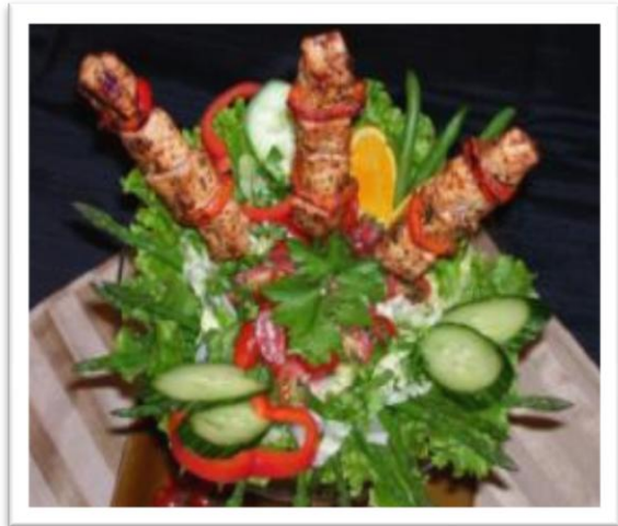
Skewered Grilled Tandoori Spiced Pork Tenderloins/Lunch Buffet Presentation