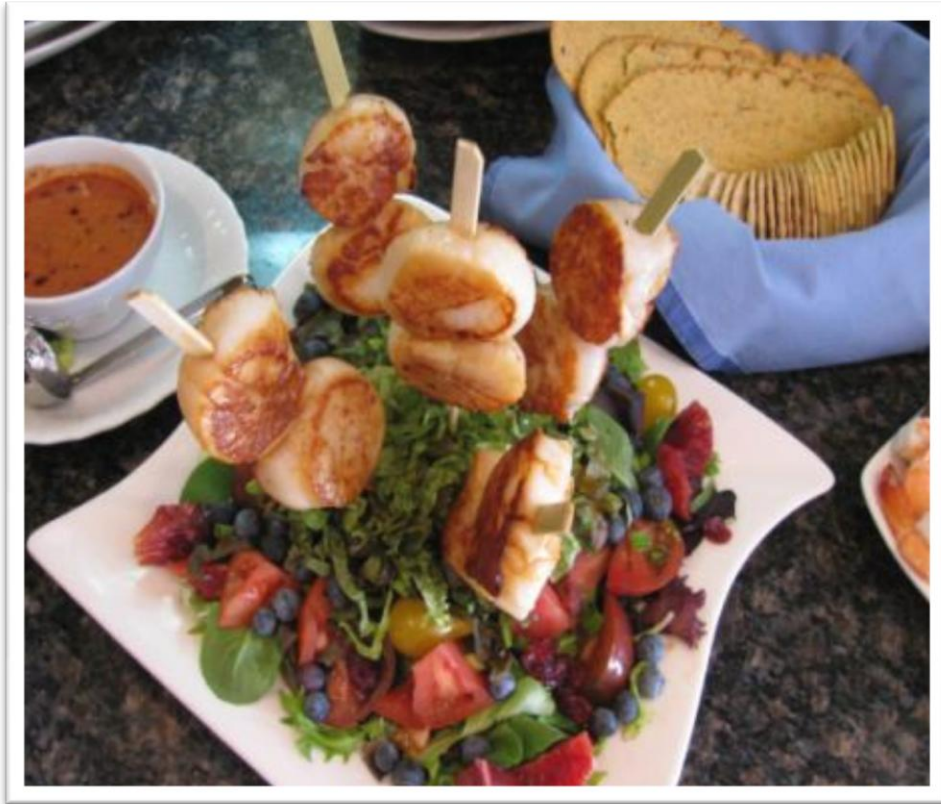
Grilled Scallop Salad Lunch Buffet item