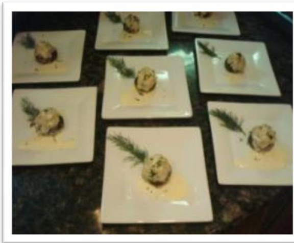
Crab Cakes with Tangerine Scented Beurre Blanc