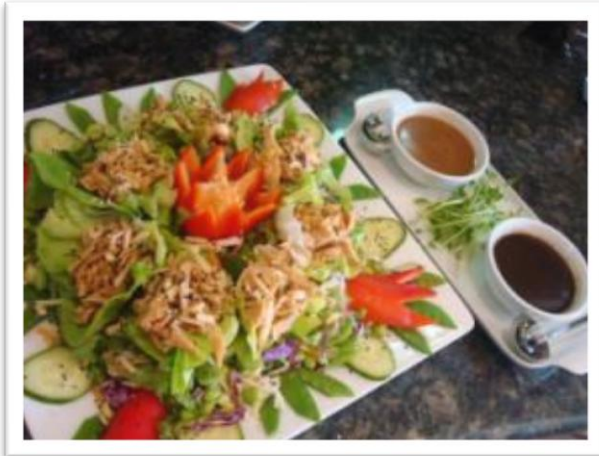
Thai Chicken Salad in Bib Lettuce Cups