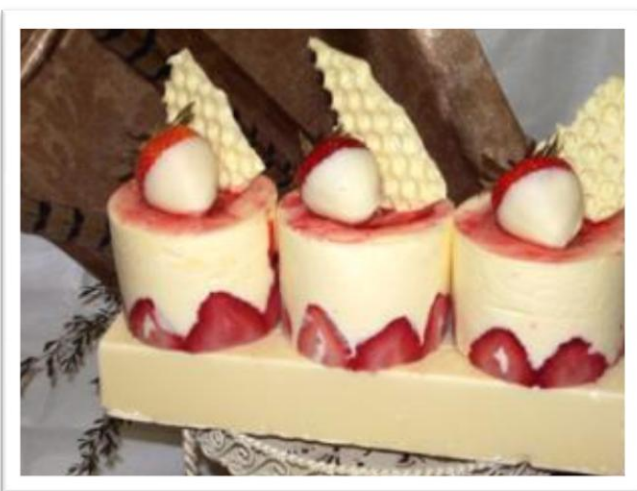
Individual StrawBerry Cheesecakes