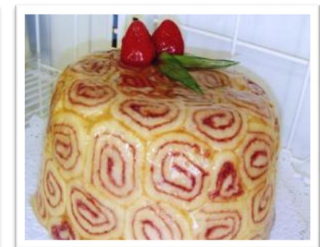
Ice Cream Filled Jellyroll Bombe