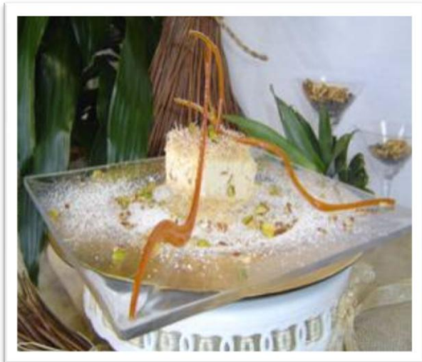
Individual Cocolate/Hazelnut Mousse and Pistachio Mousse Cakes (New Years Eve Dinner 2008)