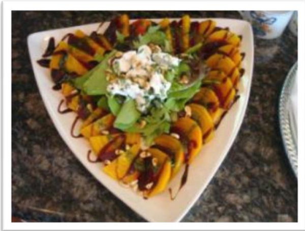
Cold Roasted Yellow & Red Beet Root Salad with Asiago Crème and Toasted Hazelnuts