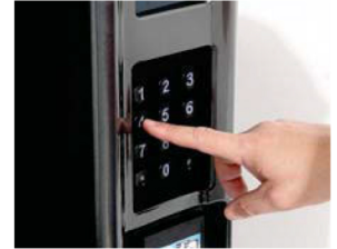
Large and easy to read selection buttons with Braille identification.