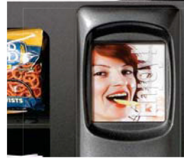
Back lighted point of sale window for advertising and specials.