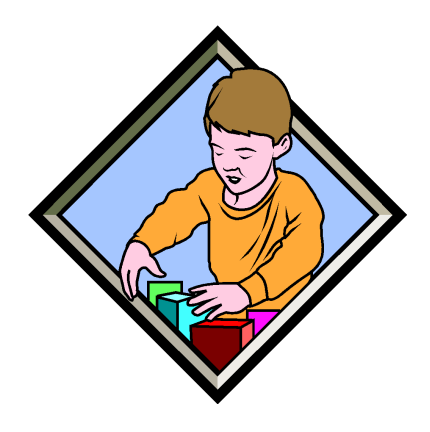
Securing Parent and Student Agreement and Active Support