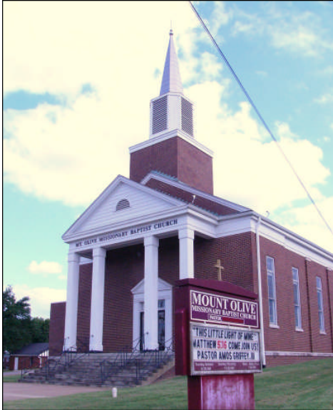
Mount Olive Missionary Baptist Church, Vision for the Kingdom of God. Matthew 28: 19-20