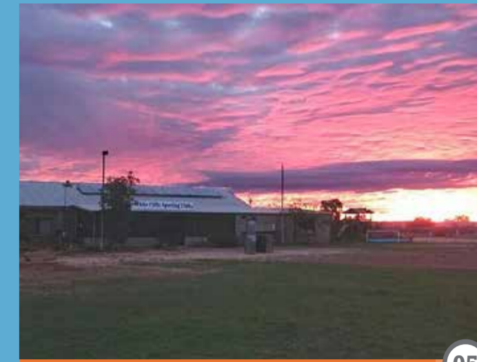
White Cliffs Sporting Club

Phone: (08) 8083 7900 www.nationalparks.nsw.gov.au