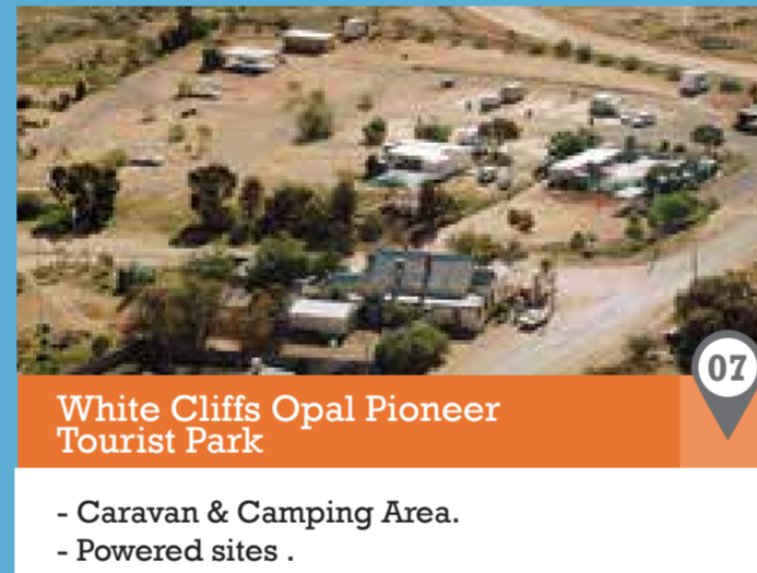
White Cliffs Opal Pioneer Tourist Park

Phone: (08) 8091 6606 Fax: (08) 8091 6782 Email: whihotel@bigbond.com www.whitecliffshotelmotel.com.au