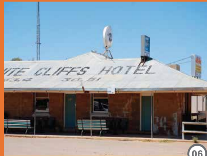
White Cliffs Hotel - Motel