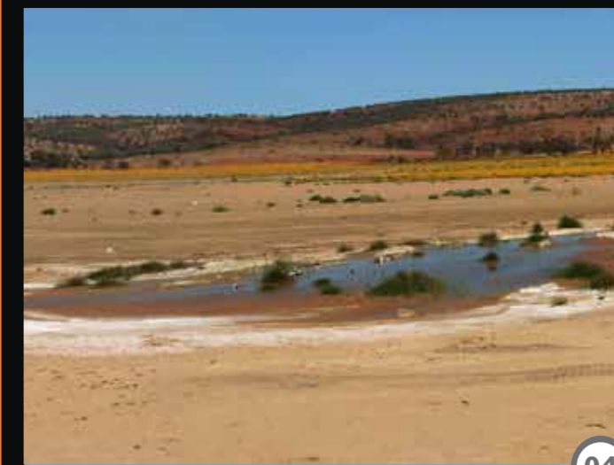
Paroo-Darling National Park

To book phone 08 8091 6677 Email: info@undergroundmotel.com.au www.undergroundmotel.com.au