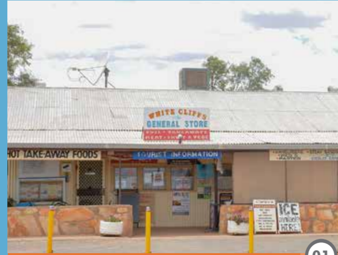
White Cliffs Outback Store & Visitor Information