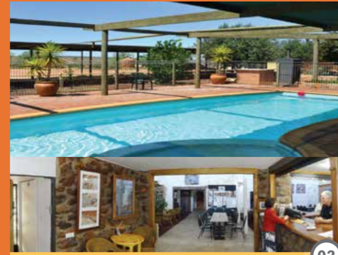
White Cliffs Underground Motel & Restaurant & Underground History & Culture Centre

Phone: (08) 8083 7900 www.nationalparks.nsw.gov.au