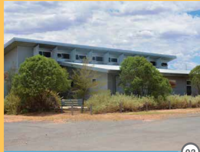
Paroo-Darling National Park Visitor Centre