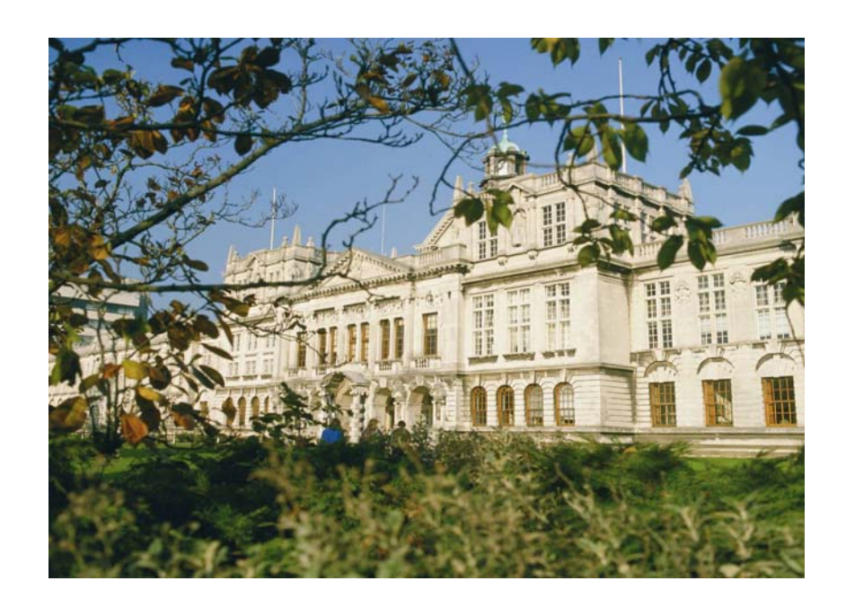
Main College, Cardiff University, Wales