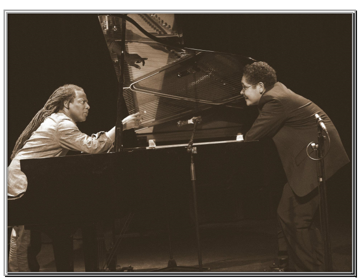
Classical & Jazz passing the baton