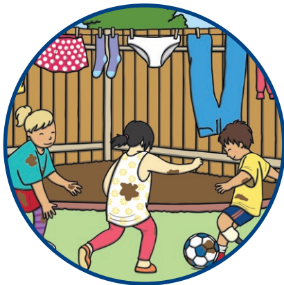
After Playing Outside