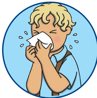
After Sneezing, Coughing or Blowing Your Nose