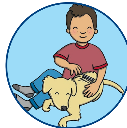
After Touching Animals