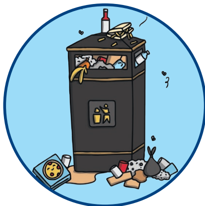
After Touching Rubbish