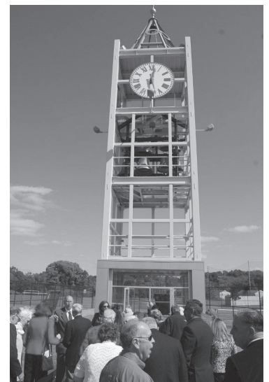
The finished Bell Tower and the crowd that assembled for the rededication ceremony.