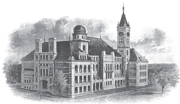
B M C Durfee High School, Fall River, Mass. DEDICATED JUNE 19, 1887