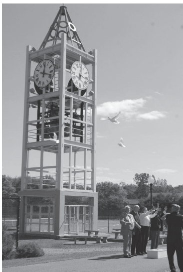
Doves are released at the Rededication Ceremony of the Durfee Bells signifying their new beginning at the current Durfee High School. The ceremony was held on September 19, 2014.

Editor's note: The writer is also author of a novel "Ransom by Mail", available on Amazon and Kindle.