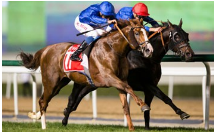
Hawkbill beating Frontiersman in the Dubai City Of Gold

HAWKBILL , winner of the 2016 Eclipse Stakes, is probably best over 1 ¼ miles (2000 metres), but he handled the Sheema course and distance well when winning the local prep for this race, the Dubai City of Gold on March 10. It was hard fought success, however, as another Goldolphin runner, the Gold Cup bound Frontiersman, pushed him all the way to the line. Hawkbill won by a head. He beat Frontiersman also when coming home the ¾-length winner of the Prince Of Wales's Stakes at Newmarket last summer. That event, also run over 1 ½ miles, is further proof that Hawkbill – who is a half brother to Kentucky Derby hopeful Free Drop Billy, stays the Sheema trip – but does he stay it well enough to handle the likes of Cloth Of Stars and Rey de Oro? If the pace comes up slow, then the answer is 'perhaps', but if it's a strongly run affair, it's a 'probably not'. Either way, we are dealing with Godolphin trainee in fine form with home court advantage. It's always a bit risky to dismiss them.