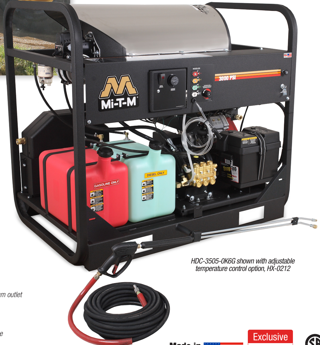
HDC-3505-0K6G shown with adjustable temperature control option, HX-0212