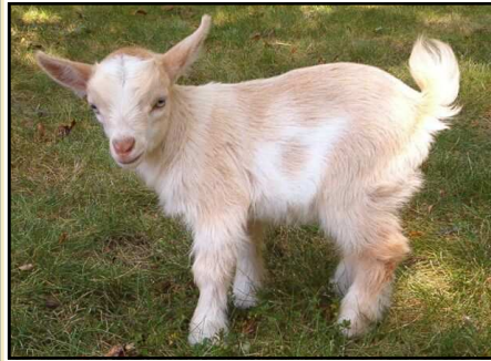
No matter how cute, a goat is still a GOAT!

In this parable, the servants ask, "...Wilt thou then that we go and gather them up? But he said, Nay; lest while ye gather up the tares, ye root up also the wheat with them. LET BOTH GROW TOGETHER"