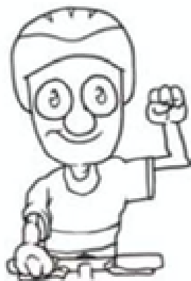
Stopping/ Slowing down