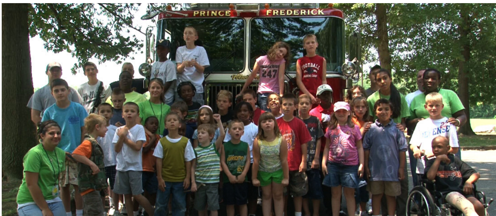
Youth International Energy & Environment Program (YIEEP) student participants.