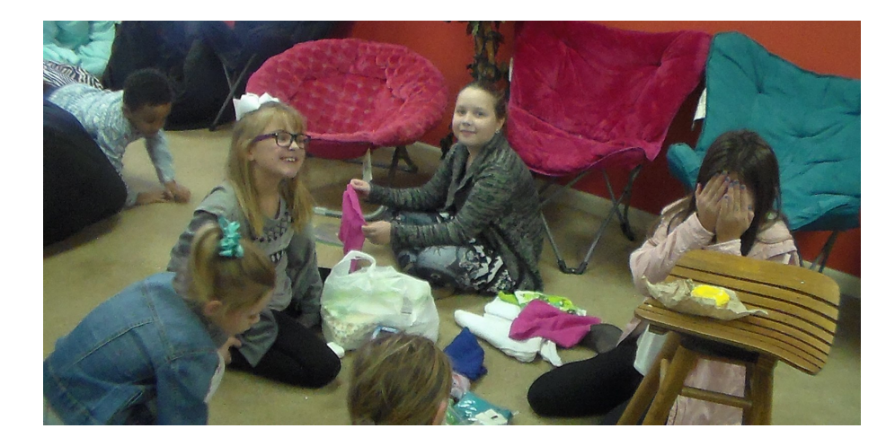
(KIDS — Continued on page 12)