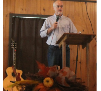
( RETREAT — Continued on page 10)

The Lunsford family decorated pumpkins and then held a silent auction for them. The auction raised $446.50 which will go towards VBC. Everyone enjoyed the variety