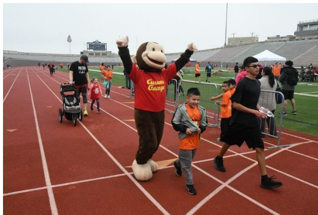
Curious George Crosses the Finish Line with Awe-Mazing Students!