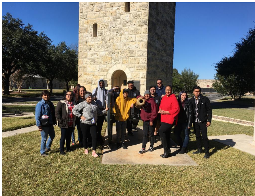
Fort Sam Houston Post Tour Group Photo