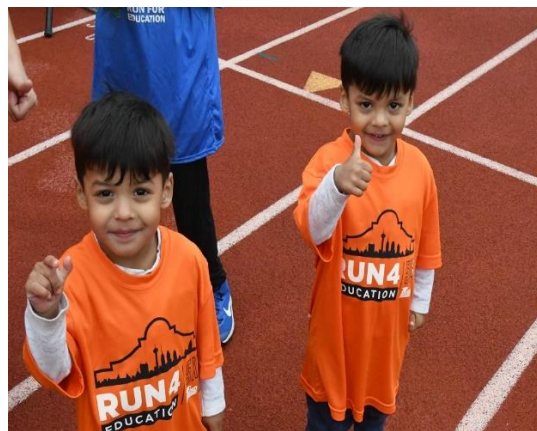
Young Boys Thumbs Up for Run