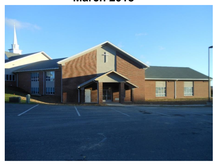
<u>Philippians 4:13</u> - "I can do all things through Christ who strengthens me."