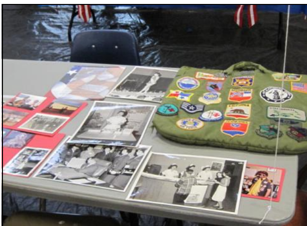
Display of Military memorabilia at Living History Day

Living History Day is one of those rare opportunities for Veterans to share their