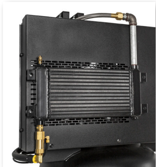
Air-cooled after cooler removes up to 65% of moisture and drops temperature within 10°F of ambient