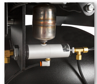
Tank drain automatically drains liquid from the air receiver