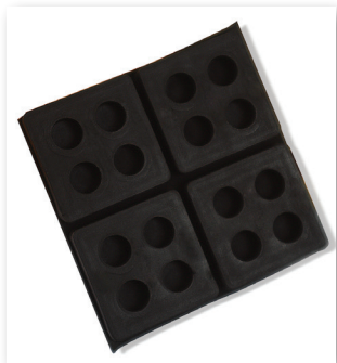
Vibration isolator pads protect the tank from stress