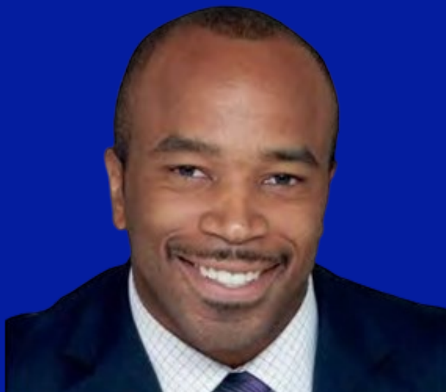
State Senator Bobby Powell, Jr. West Palm Beach