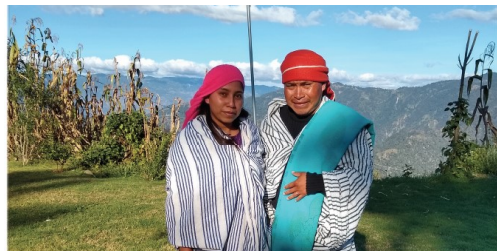
(MISSIONS — Continued on page 12)