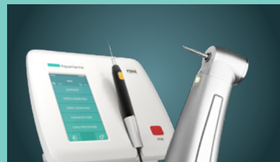
INSTRUMENTS AND LASER