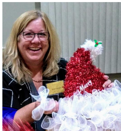
Vol 49 - Issue 4