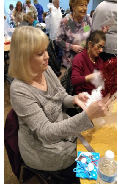
November 6 th Craft Night