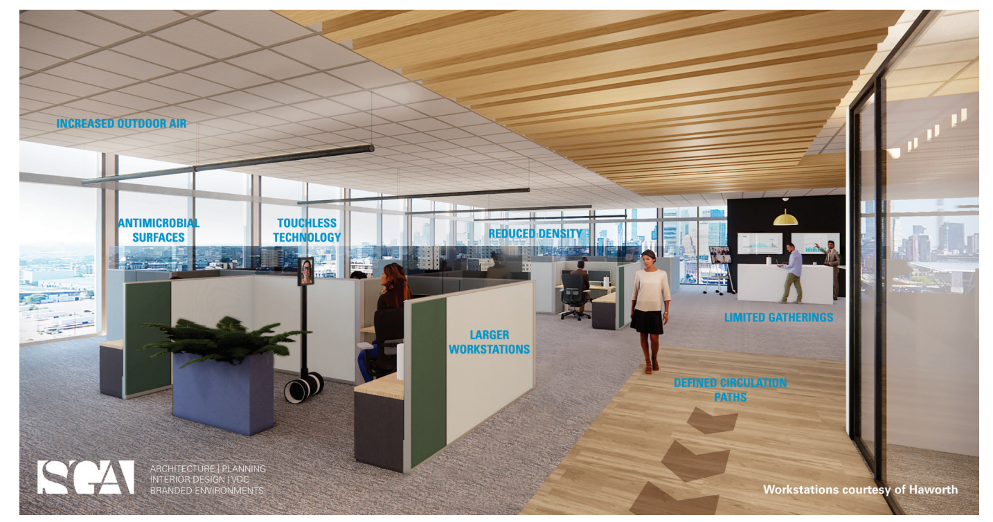
Rendering courtesy of SGA

05.01.2020 | Issue 01: Return to Work Toolkit