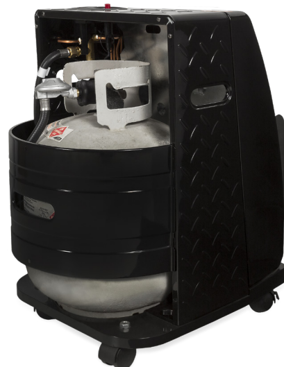
MH-0018-0M10 back view, shown with 20-lb. LP tank (Not included)

Please see heater "Owner's Manual" included with each heater for a complete list of important safety information. These specifications are estimates only.