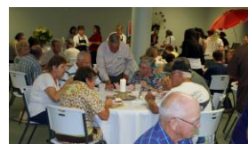
Everyone enjoyed the food.