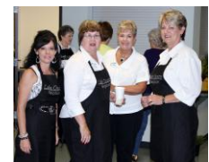
LCN volunteers in the new aprons.