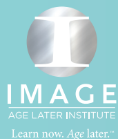
IMAGE Age Later Institute, is dedicated to providing exceptional education through innovative curriculum and hands-on experience to licensed skin care professionals to further its mission of helping the world to Age later.