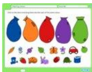
Matching Colours game

At the side click on 'non-members free content' and you can find some games which the children might enjoy.