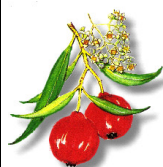
'Quandong' painted by Rosemary Pedler