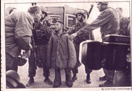
Detained: Reporters ask questions of a Palestinian boy who was caught wearing a suicide-bomb vest at an Israeli checkpoint south of Nablus in the West Bank.

But one child changed his mind , as he approached an Israeli checkpoint with explosives strapped to his frail body. His natural desire to stay alive became a dominate factor as he raised his little hands and said, " I don't want to die. " No one does, unless they are deceived .