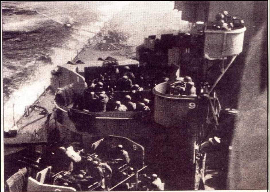
USS Missouri under attack: A kamikaze is shown before colliding with the U.S. warship in 1945 in the Pacific Ocean. Recent findings suggest the picture was taken by one of the ship's cooks.

God has never instructed man to take his own life, and God never will. God IS life : " In him was LIFE; and the LIFE was the LIGHT of men " (JOHN 1:4).