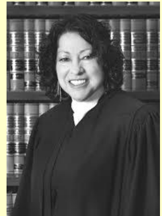
Justice Sonia Sotomayor

this at the Let Girls Learn Event to Celebrate International Women's Day on March 8 th , 2016 in Washington D.C. Once we have the education, so many opportunities open up for girls and boys alike.