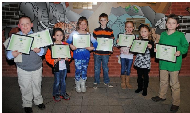
Winners of Art Contest announced at the annual Awards Banquet.