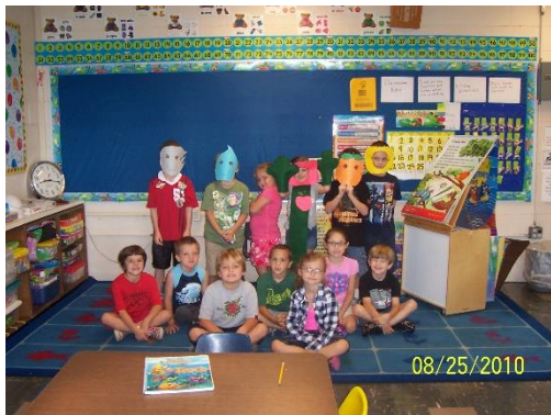
The Plant – n – Me, an Environmental Education Lesson.