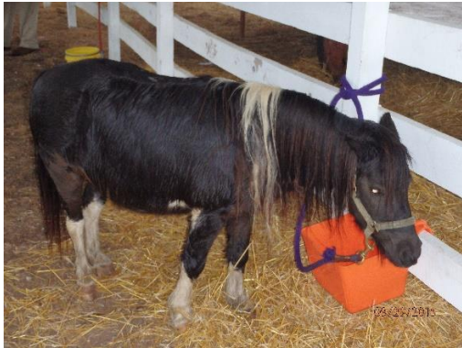
Farm Animals at Youth Ag Day

This Environmental Education Program has been a Great success in its 20 year existence. It is well- received by teachers and students.