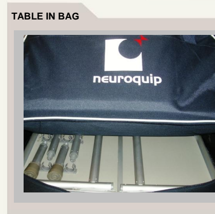
TABLE IN BAG