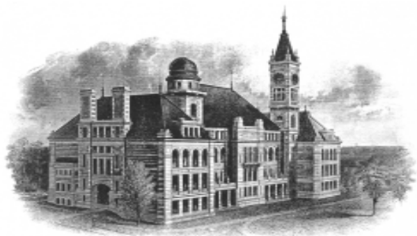
B.M.C. Durfee High School, Fall River, Mass. Illustration 1900-1910