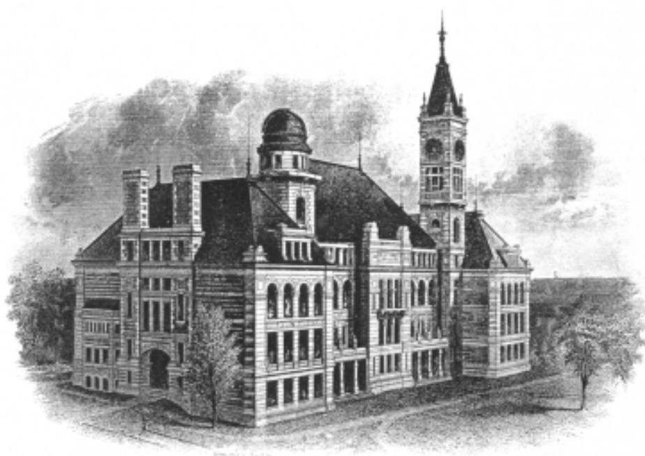
B M C Durfee High School Fall River Mass. DEDICATED JUNE 16 1887

Raise our praises high to Durfee, Alma Mater dear. Tow'ring high beside the river, Radiant beacon clear.