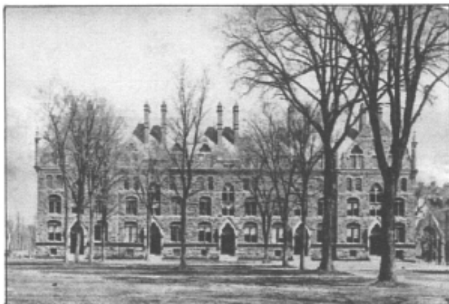
DURFEE HALL - YALE UNIVERSITY - 1870S