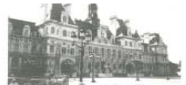
S.H.C. Durfee High School (left) Hotel de Ville, Paris, France (right) The Durfee building's design was based on the Hotel de Ville in Paris.