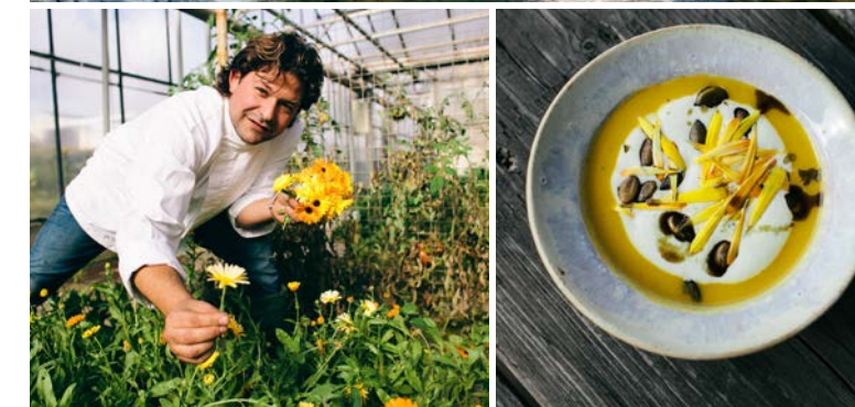
Restaurant & Hotel Conservatorium, Amsterdam