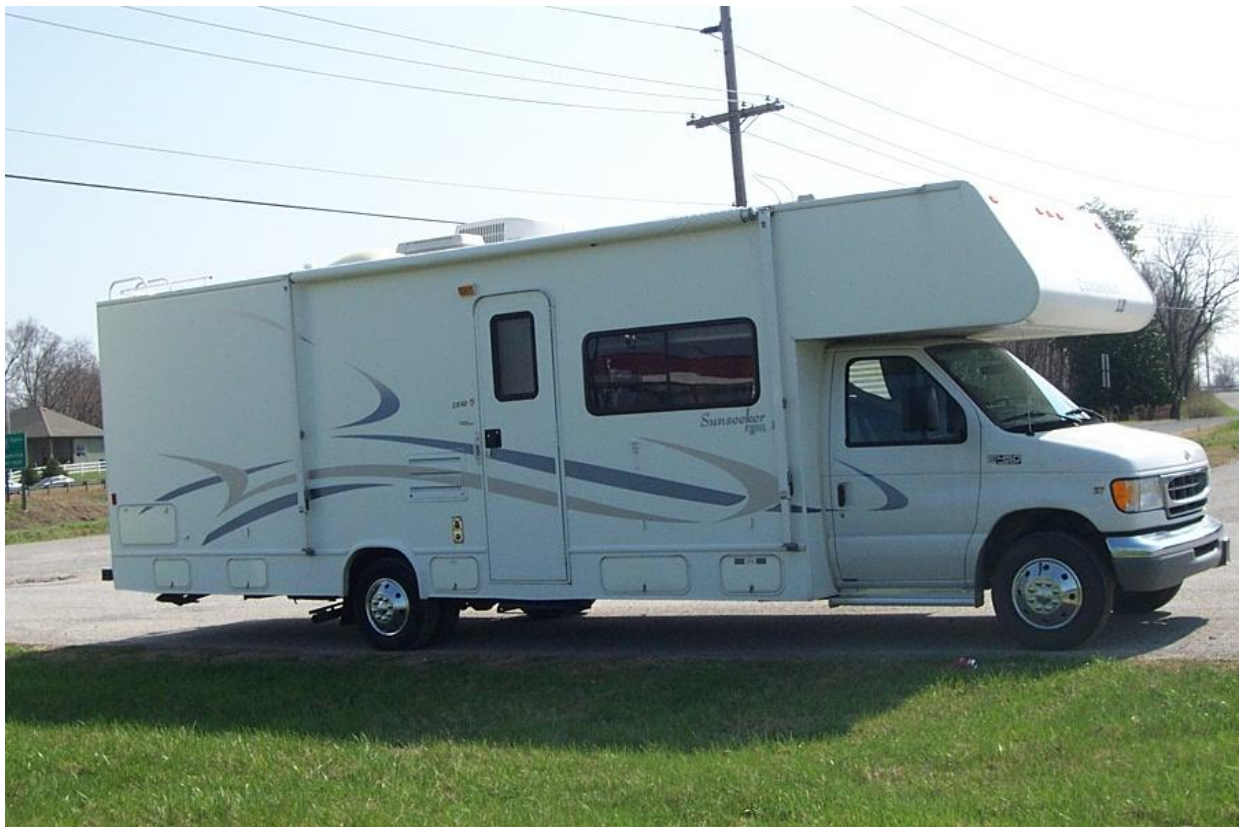
Forest River 30' Sunseeker, Ford E450