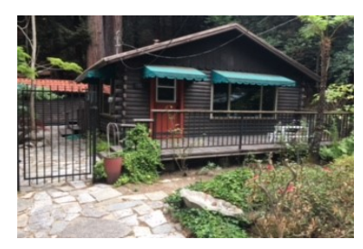
585 Keystone Way

This is a 1Bed,1 Bath located across from the Social Hall. Central Heat & a wood burning fireplace in the living room. Completely remodeled Bath. All with a deck overlooking the river. $195,000 PENDING!