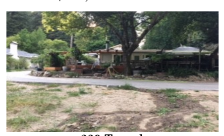
239 Temple Great location on Sandy Beach! 2 Bed/1 Bath beach house with a little over 1000sq./ft. Vaulted beam ceilings and a wood burning fireplace. Tons of decking to help take in the view.