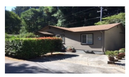
135 St. Alban Cute 2 Bed/2Bath home in Section 6. Come and see this great little charmer. Includes central heat, single level and new appliances. $299.950.