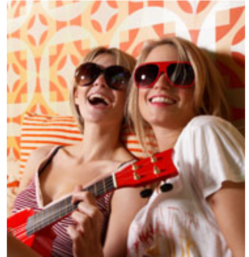
Surrounding yourself with happy people is healthy!

What's one way to get happy? Try massage! Exposure to stress, a contributing factor to unhappiness, over a long period of time can increase the rate of neural degeneration and increase the risk for Alzheimer's disease. Luckily, a study from Umea University in Sweden has shown that just five minutes of massage has the potential to lower stress, and 80 minutes of massage has a tremendously positive effect on stress levels. Get massage, get happy, and cheer up your friends and family!