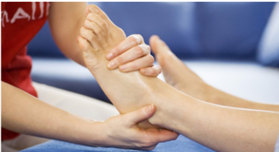
The foot has a greater quantity of sensitive nerve endings than other body parts.

Although simplistic in application, the effects of the treatment can be profound. Through activation of nerve receptors in the hands and feet, new messages flood into the body system, changing its tempo and tone. In essence, the foot or hand becomes a conduit for sharing information throughout the