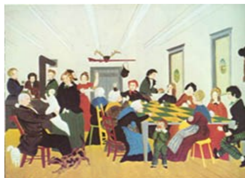
The Quilting Party by an unknown artist 1840 -1850