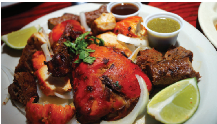
Mixed Grill Tandoor Platter