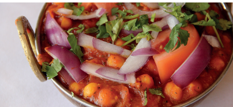
Chana Masala with onions added

Boiled eggs cooked with fresh Indian spices, ginger, garlic, onions & tomatoes