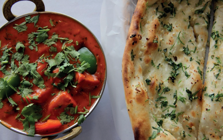
Chicken Tikka Masala with Garlic Nan