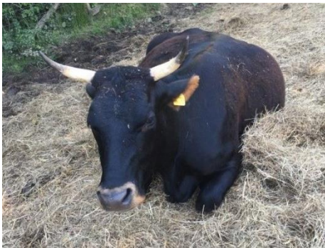
Ruby Red Devon X Cow bn 10.7.15. Due to AA next month