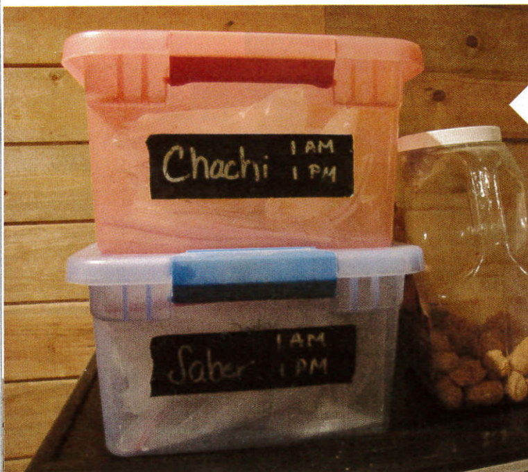
Create a system for managing each horse's supplements.