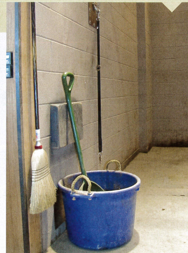
A manure tub, shovel and broom in grooming bays serve as a gentle reminder to clean up after each horse.

your barn has a full-fledged office with a computer or a little table in the corner of the tack room, certain documents and details must at your fingertips. Find a system that works for you, whether storing data on a laptop, in a binder, or in a filing cabinet. Use that system to keep horse health records and phone numbers of important individuals such as owners, veterinarians, insurance agencies, and farriers handy.