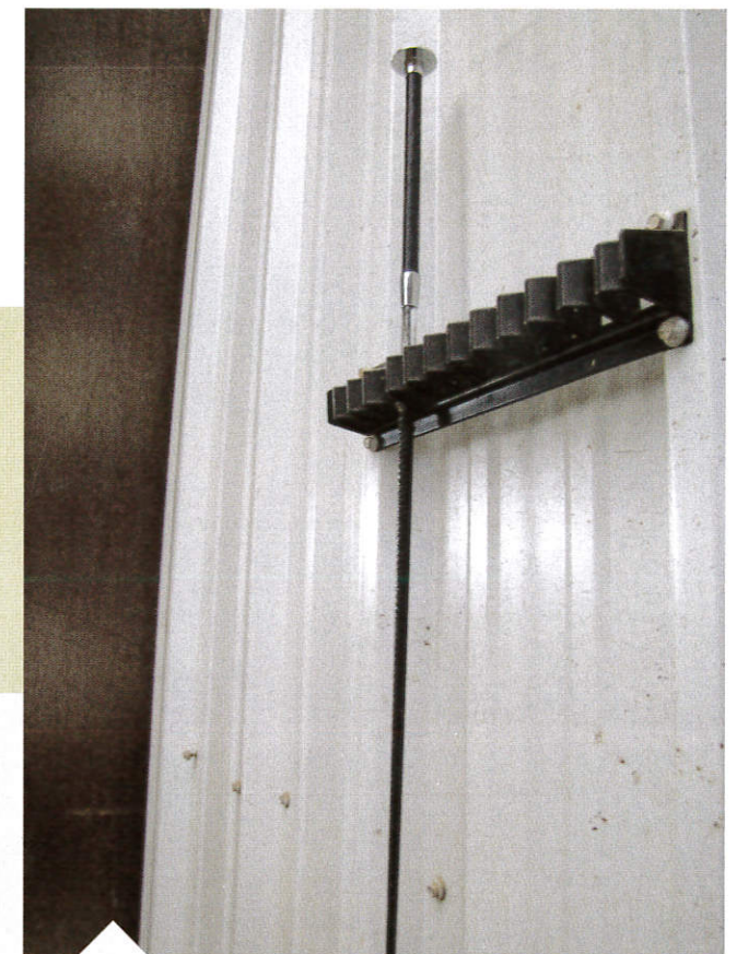
A whip organizer in the arena saves riders a trip back to the tack room.

To keep clutter in the arena to a minimum, store jumps,