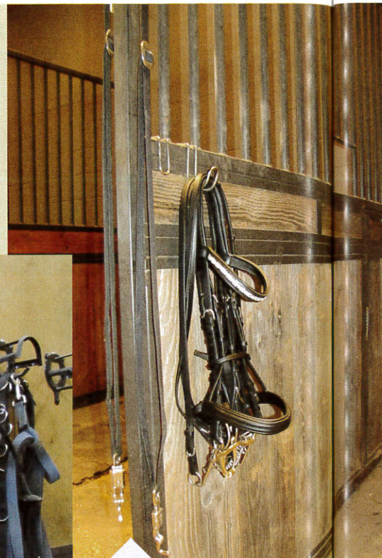
Hooks in cross-tie areas make tacking up a snap.