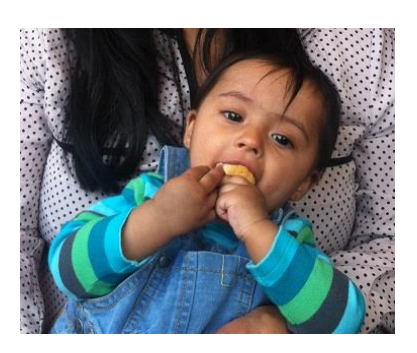
Above: Some Good Counsel Babies who we've snapped in the last few weeks!