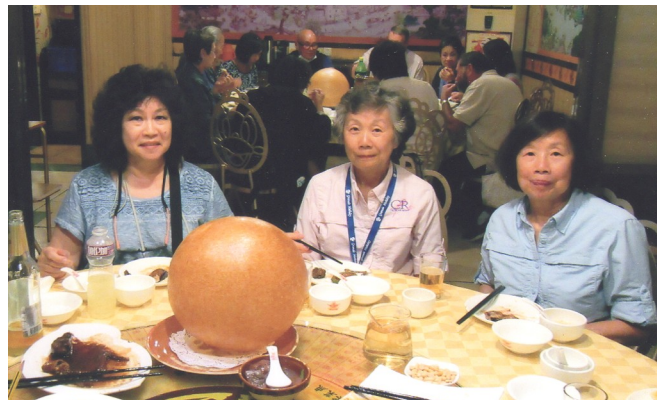
Yes, that “ball” in the center of the table is a giant jindui , specialty of the renown Shi Qi Lao Restaurant.