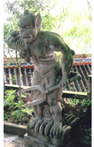
One of Fenduo Ghost Town statues depicting the denizens of Hades.

The next day we were off to Shenzhen for a whole day of shopping at the well-known five-story Luohu Shopping Plaza. We shopped "til we dropped" or just ran out of money. But that did not deter quite a few of us from having a last gourmet experience. At the popular Laurel Restaurant located in the Plaza, we had a seven-