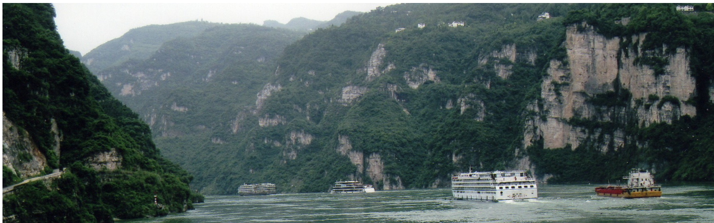
Shennong Stream at its widest point (above) appears more a river, but at its narrowest point (below) looks like white water rafting in the Grand Canyon. Note the boats — resembling those used during Dragon Boat Festival season.

The society's tour of the Yangtze River and Zhongshan was not only a diplomatic success but an enjoyable experience for all. Besides reestablishing the society's relationship with the Zhongshan City and Nanlang Township governments and finding our roots, it was a tour filled with sightseeing, shopping and eating and more eating.