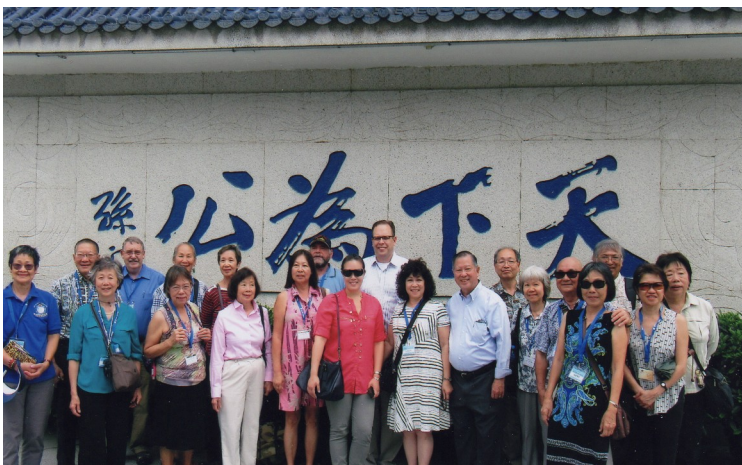
The SDDS delegation in front of the Sun Yat Sen home and museum in Cuiheng Village.