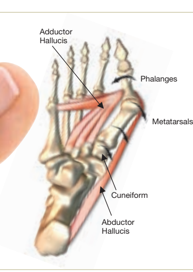
Fig. 1: ANATOMY OF A BUNION If the metatarsal or cuneiform bones are shaped unusually, the metatarsal tends to shift outward. When the adductor hallucis gets tight, it pulls the phalange of the big toe inward and the abductor hallucis becomes overstretched.

But heredity is not the only cause. Tight shoes—combined with a habit of walking with the feet turned out—