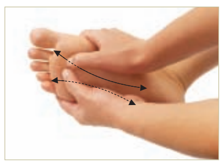
Fig. 4: FOOT MASSAGE Start at the base of your toes and massage down through the inner arch to release the adductor muscles.

Once you get the toes moving, try this: after lifting all of your toes, keep your small toes lifted and extend only your big toe forward and down toward