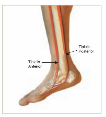
Fig. 2: THE TIBIALIS MUSCLES The tibialis anterior muscle inverts the foot and lifts the front of the arch. The tibialis posterior muscle lifts the middle of the arch.

← The tibialis anterior isn't the only foot muscle that supports healthy alignment of the big toe; the tibialis posterior does, too. To learn how to activate and strengthen the tibialis posterior, log onto YogaPlus.org and click on "Yoga Therapy for Your Arches."