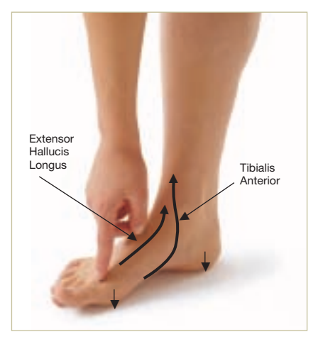
Fig. 3: ACTIVATING THE TIBIALIS ANTERIOR Keep your beel and the mound of your big toe grounded (you can use your finger to belp) as you lift your big toe. Draw energy up from below the big toe mound toward your ankle to activate the arch.