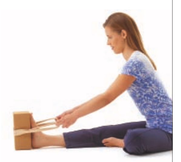
Fig. 12: SEATED FORWARD BEND Place a block at the sole of your foot and secure it with a strap. Be sure to keep the block square while you practice the toe exercises.

Last but not least, seated forward bends provide an opportunity to work the feet without experiencing the painful consequences of bearing weight on a bunion. Place a yoga block at the sole of your foot and a strap around the block, so that you can work the actions of the foot as if you were standing on the floor (Fig. 12). Press through the toe mound (especially beneath your big toe) and into the block, keeping the block square while working your toes.