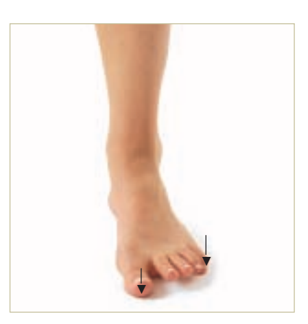
Fig. 7: ADVANCED TOE EXERCISE Keeping the middle toes lifted and spread, extend your big and little toes out and down to the floor.

These toe exercises can be incorporated into many yoga poses to enhance