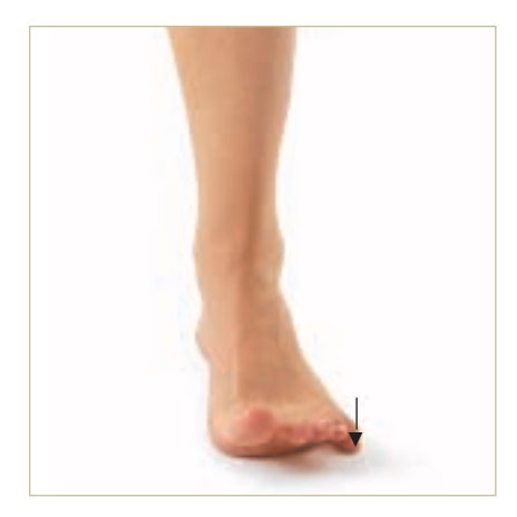
Fig. 6: LITTLE TOE EXERCISE To strengthen your outer ankle, raise all your toes, then extend only your little toe out and down to the floor.

To go further in strengthening your feet as a whole, raise all of your toes, and then extend only your little toes out and down to the floor (Fig. 6). This works the muscles running from the little toe along the outer shin and even along the outer thigh, strengthening the alignment on the little toe side of the foot, while building and stabilizing healthy arches. Weakness and tightness in this side of the foot and ankle often accompanies hyperextension of the knees, as well as pronation of the feet, or fallen arches. Strengthening your outer ankles and shins in this way helps your knees, particularly if you have flat feet.