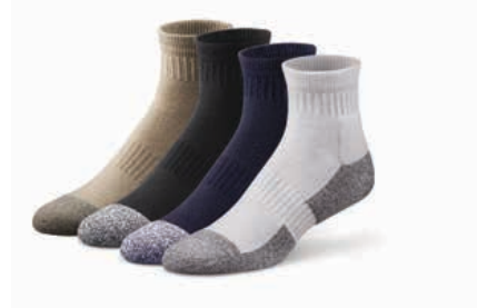
B | Ankle Length