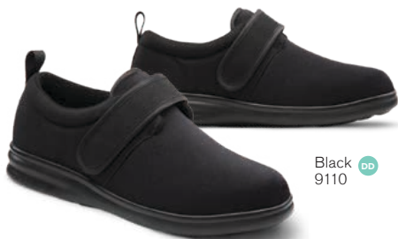
Black DD 9110