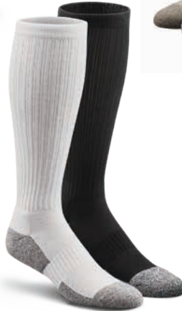
D | Over the Calf