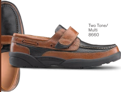
Two Tone/ Multi 8660