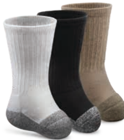
F | Transmet