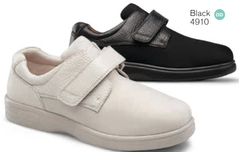
Black DD 4910