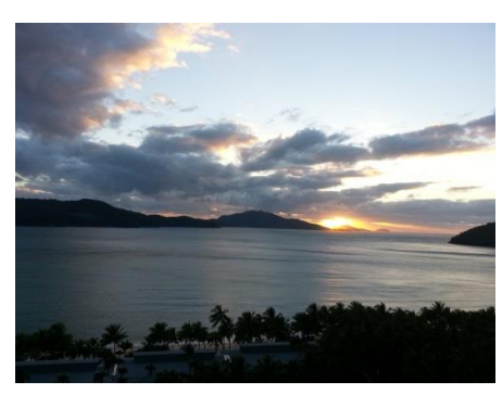
Sunset over welcome drinks