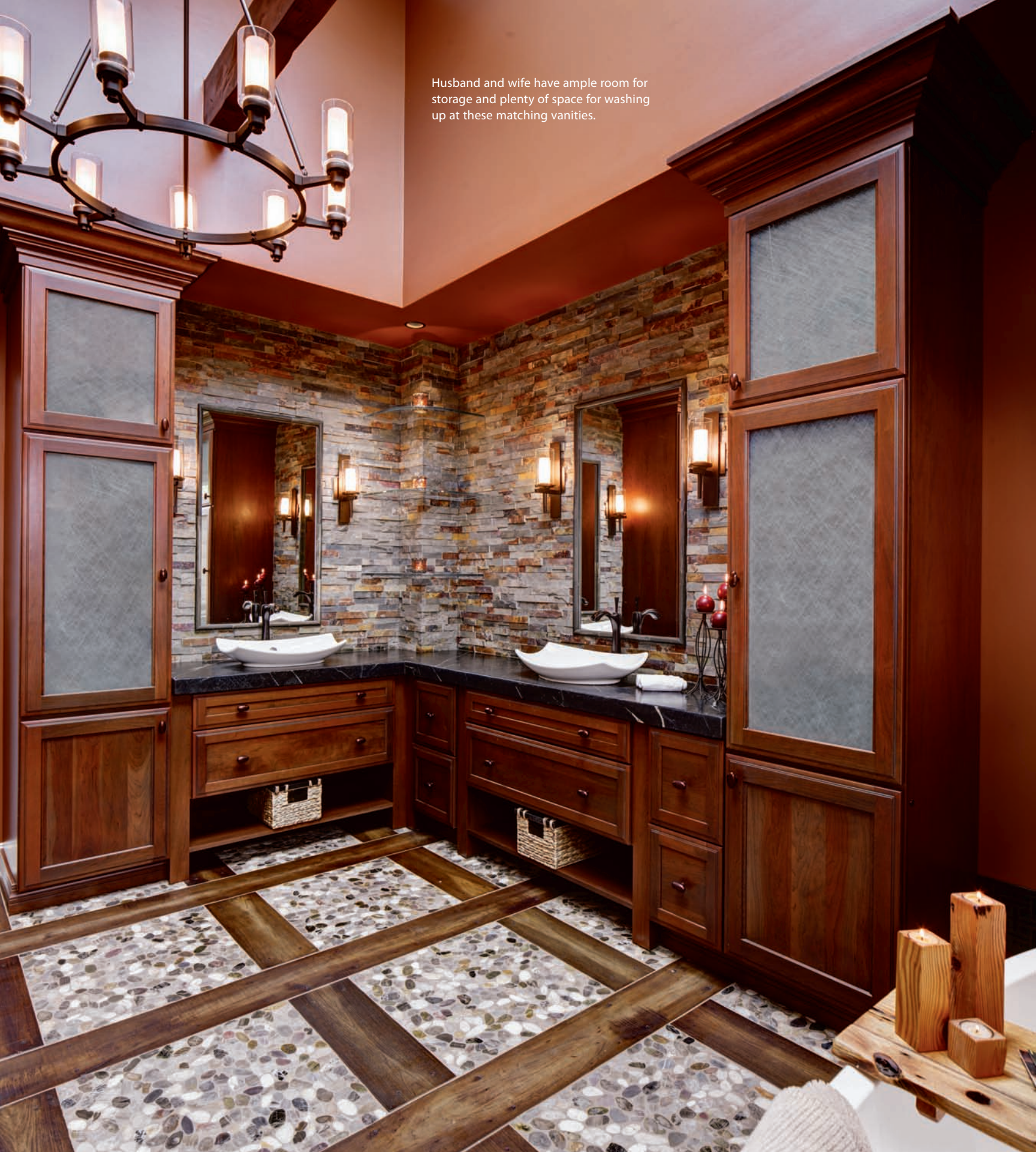
Husband and wife have ample room for storage and plenty of space for washing up at these matching vanities.

The floor is as much a focal point as the ceiling. “We used natural stone pebbles with endless shapes and colors on the floor.” The “wood” planks framing the stones are actually made from concrete, which is more durable in a bathroom environment, where water is a factor.